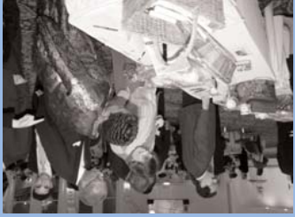
Dinner attendees take a closer look at at auction items during a Project Enterprise Auction Event.

WHERE: Steinway Hall 109 W 57th Street New York, NY 10019